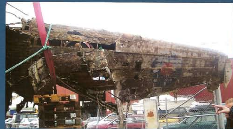
Ashore at Trondheim harbour and one of the wings shows off its RAF roundel.

It was exciting to be there. All the students were sitting around the TV screens making notes. To see their faces and hear their reaction when the wing appeared on screen was fantastic".