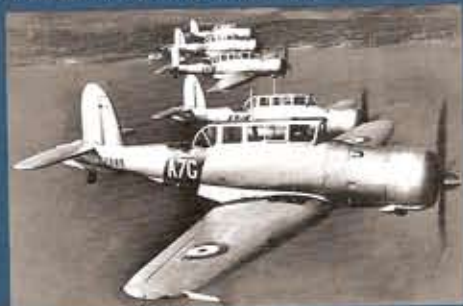
A flight of Skuas. This unsung aircraft achieved some notable 'firsts' including that of being the first aircraft to sink a large enemy warship.

The ungainly Skua was the Fleet Air Arm's first operational monoplane and the Royal Navy's only true dive bomber, although it was also to have a secondary role as a fighter, which soon proved to be a mistake, suffering heavy losses when confronted with modern fighters. Although reasonably well armed for