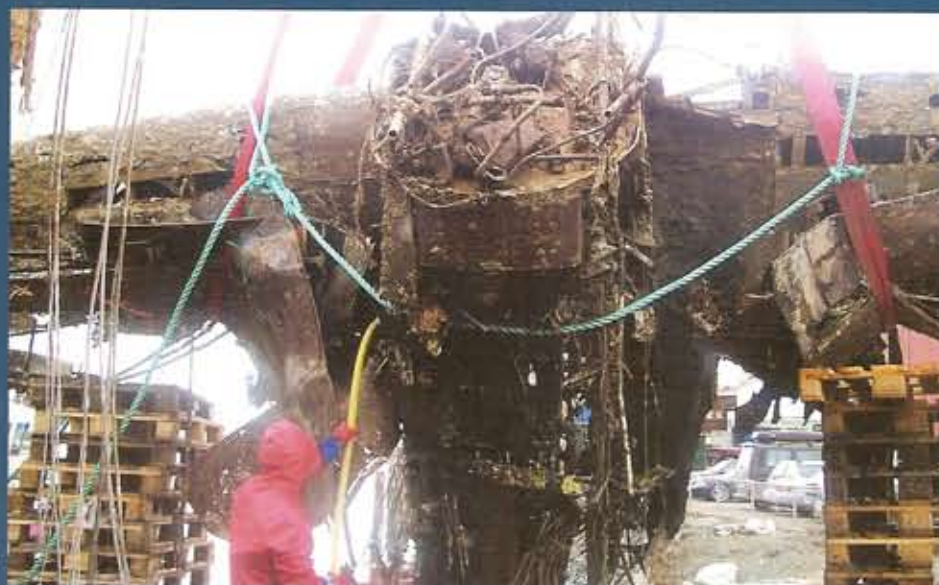
The centre section is a vital part of this wreck, as this is missing from the parts cache in Norway, and also from the recovered remains at the FAA Museum, Yeovilton

The above operation was made possible by the use of the Norwegian University of Science and Technology (NTNU) vessel 'Gunnerus',