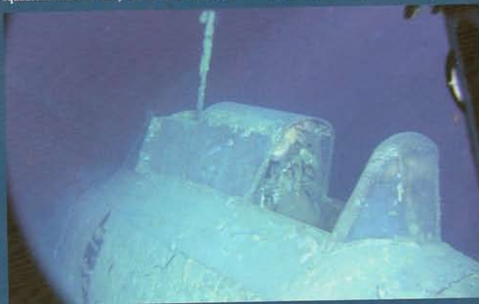
L2896 was discovered at a depth of 242m, perched precariously on a cliff that held the wreck from falling a further 200m!

Skua L2896 was located on 25th April 2007